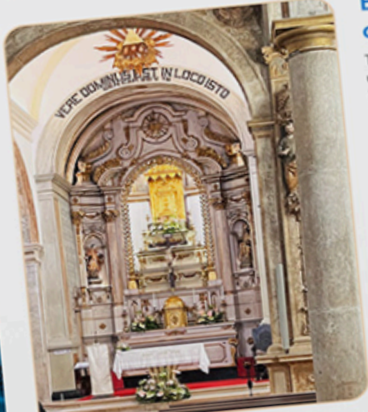
Eucharist Miracle Santarem, Portugal 13th century

Throughout history, Jesus has shown us that he is really present in the Eucharist. In fact many documented Eucharistic miracles have occurred as a result of someone's faith in the Real Presence of Jesus. These miracles show that His Body is really present in the Eucharist. Miracles to help our faith and to remind those who are not really present in the Eucharist that Jesus is really present in the Eucharist. Miracles in which the Host has become human flesh and blood, or the greatest miracle of all, when bread and wine change into the Body, Blood, Soul and Divinity of Jesus.